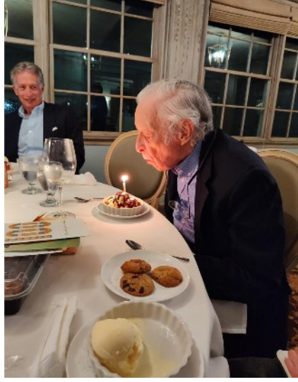
Melody Men Serenade Ros