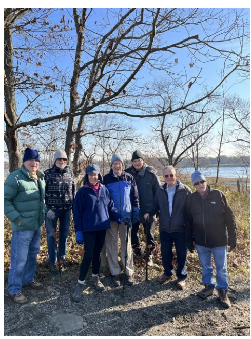
The intrepid Walkers

Pickleball: RMA pickleball is played, weather permitting, from 11 am until 1 pm on Mondays and from 10 am until 12 pm on Thursdays, at Christiano Field. We will continue