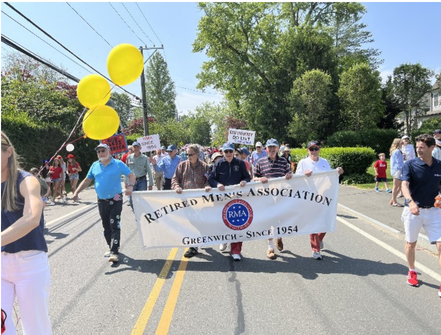
RMA on Parade