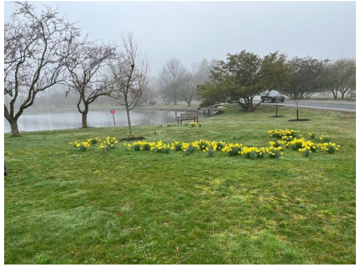
Bruce Park daffodils on a misty morning