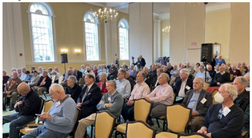
The Congressman drew a large crowd

To see the full presentation, go to https://greenwichrma.org , cursor to “Speakers” and click on “Speaker Videos.”