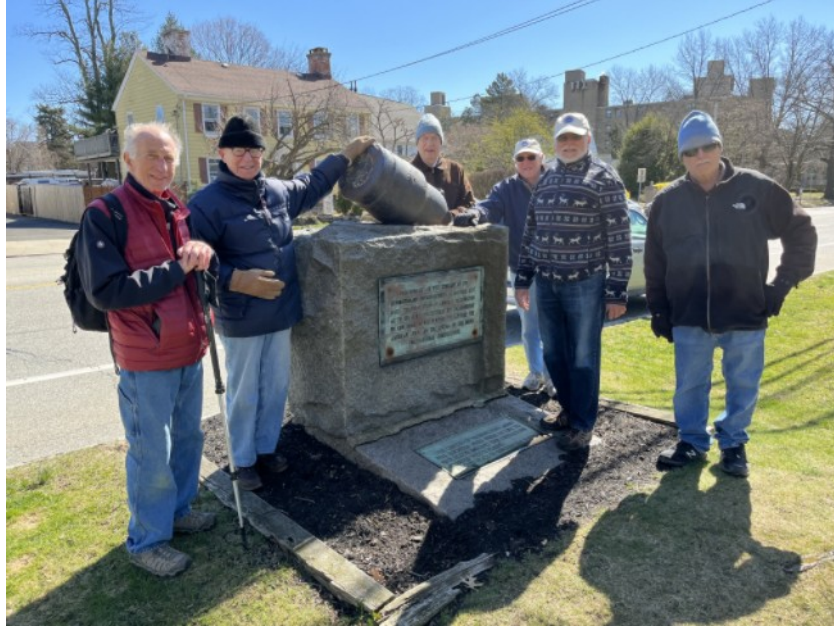
The RMA Army, with cannon

Note: pictures are eagerly solicited from other RMA activities. Come on guys, you've all got a camera in your phone!