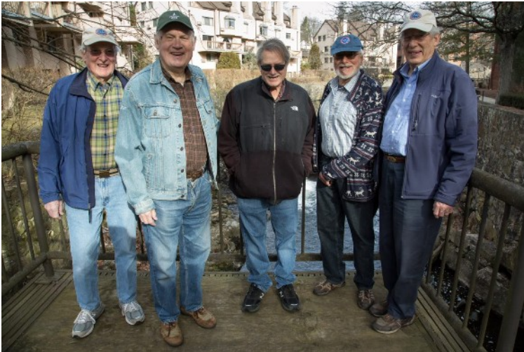
Walkers by The Mill in Glenville "Will this thing hold us?"