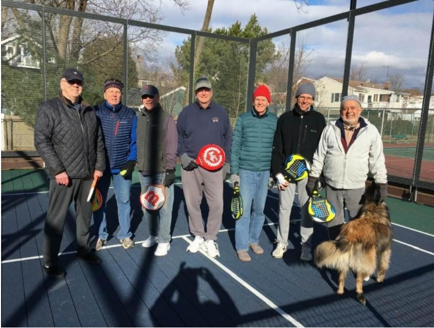
The Paddle Tennis gang in 2020