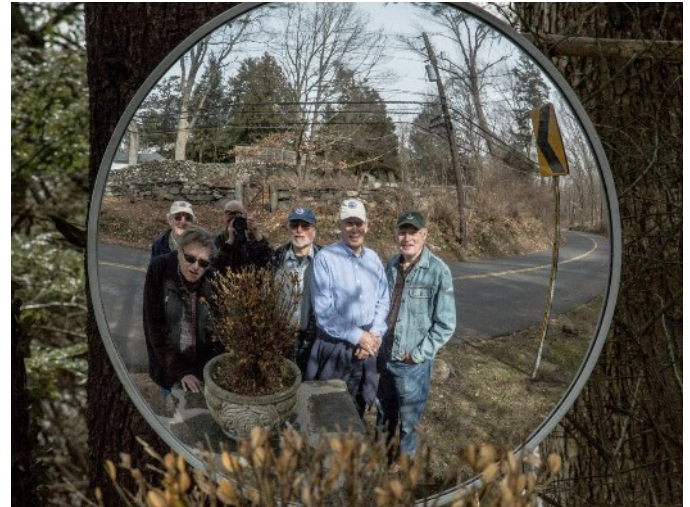
A Walkers' "Selfie" With a cemetery in the background!