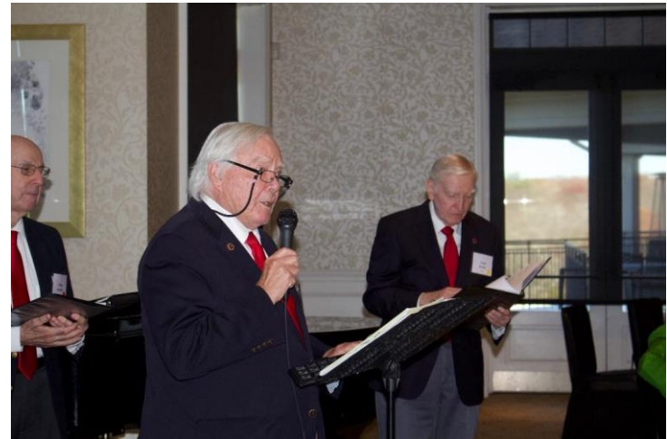
The Melody Men