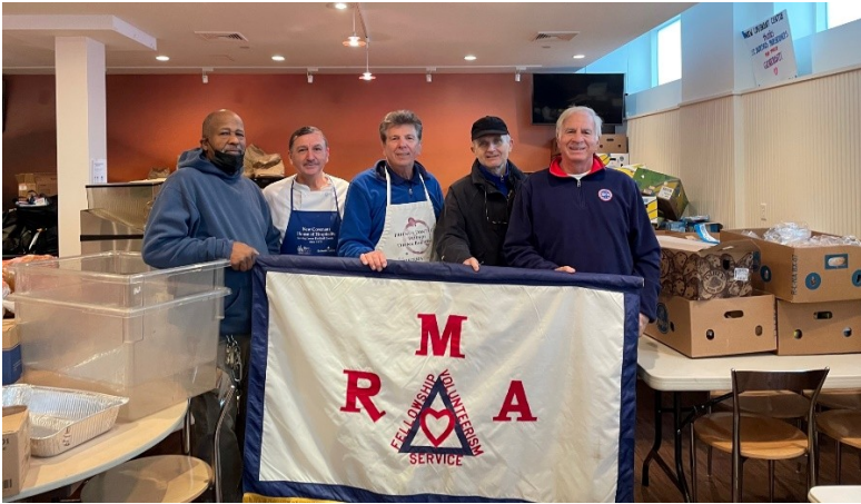
RMA Volunteers at Covenant House