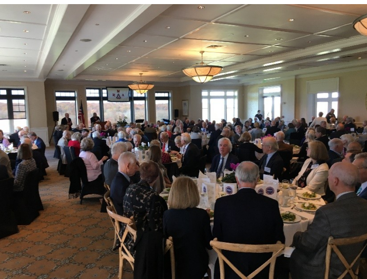
Good food and good company