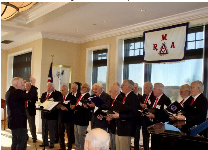
The Melody Men Entertain