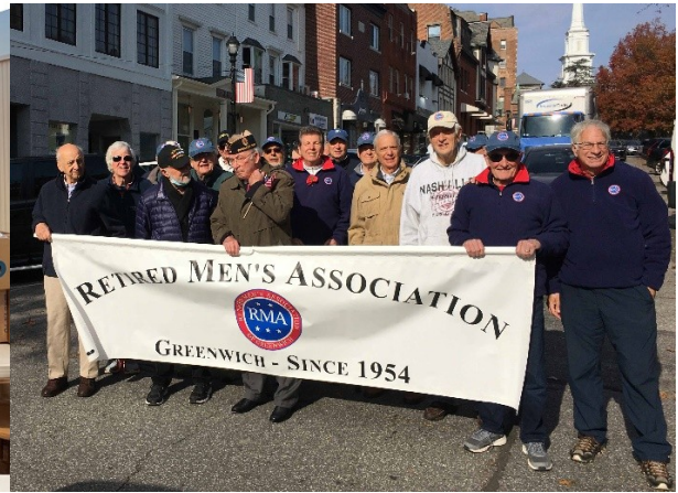
Marching in the Veterans Day Parade