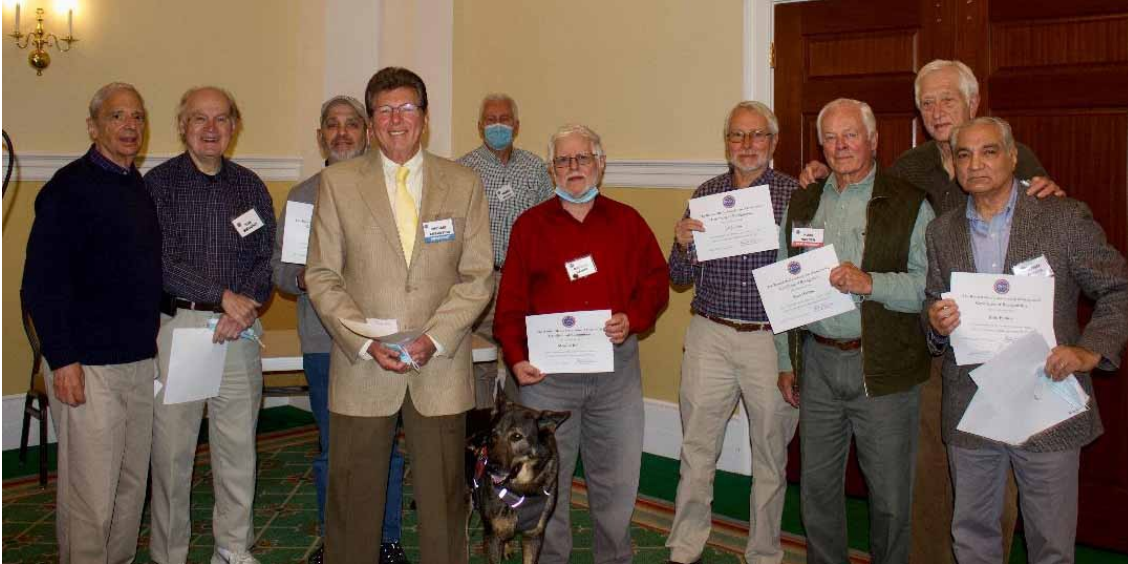
Ten volunteers receive RMA Service Awards