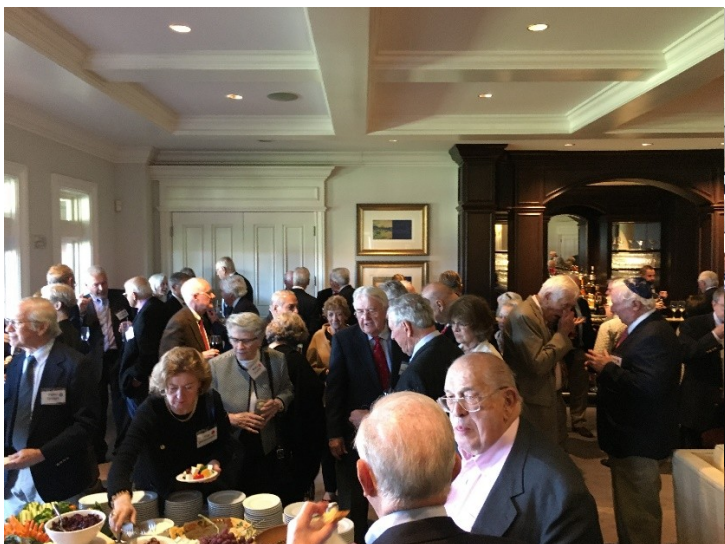
Meeting at the Reception