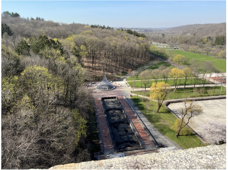
As requested. Walkers by the 9-11 Memorial; Memorial and Plaza from walkway atop the Dam.