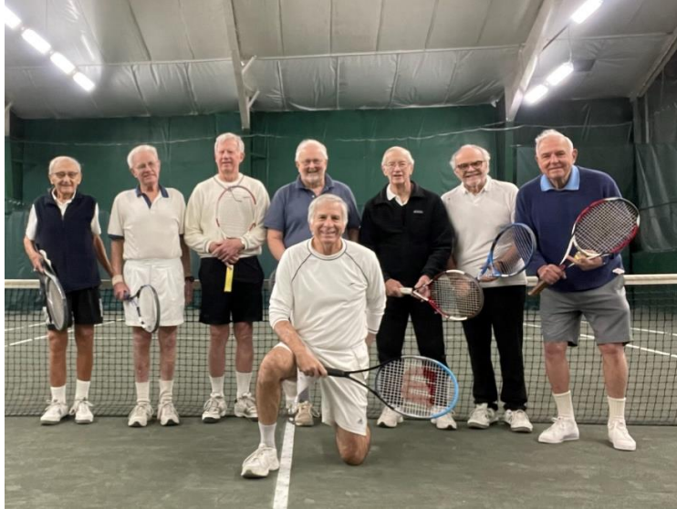
The Tennis Brigade, December, 2021